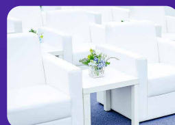
Access to Hosted Buyer Lounge