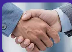
Exclusive Business Matchmaking Services