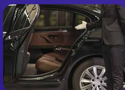
Airport / Hotel Transfer